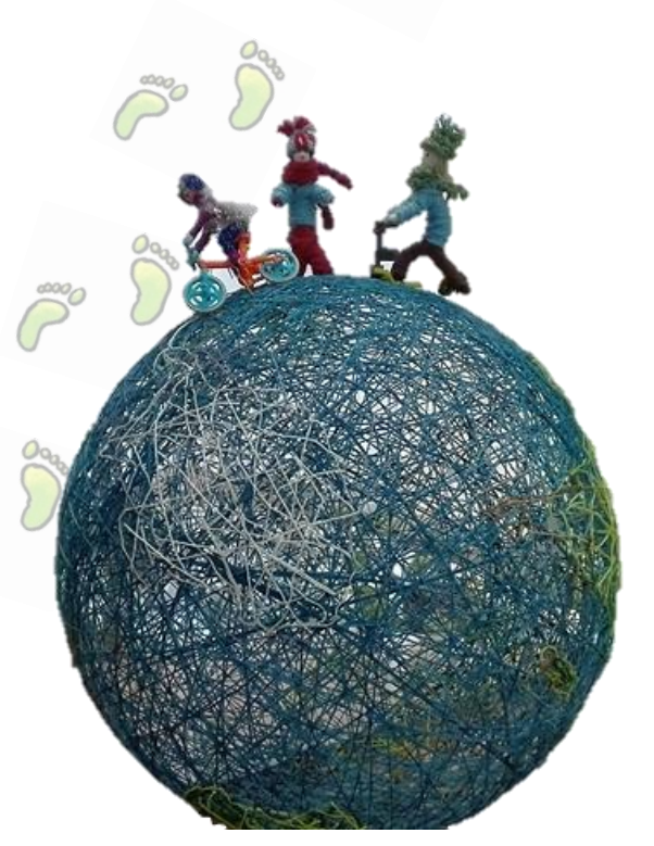
ZOOM-Kids know: the Paris Agreement is just another step – Move on for Climate Action!

For further information also visit www.zoom-kidsforclimate.eu